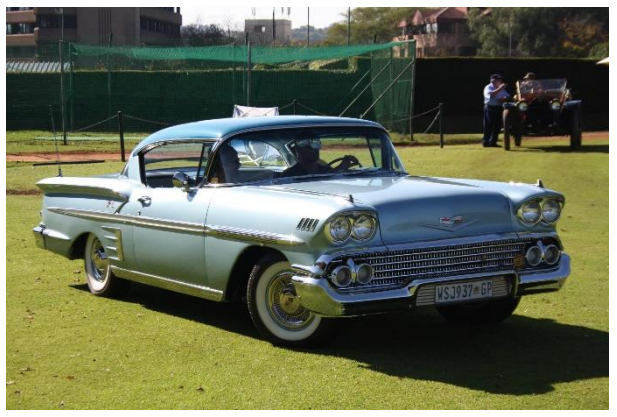
Cecil and Gail White's 1958 Chevrolet Impala Sport Coupe