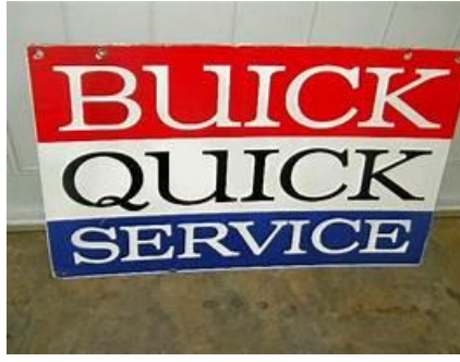
Post World War 2