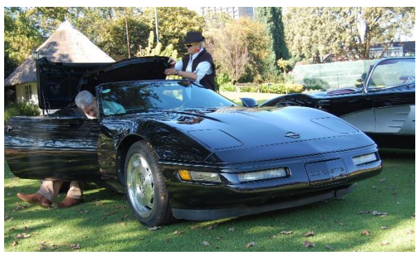
Rijkent Mulder's 1992 Chevrolet Corvette