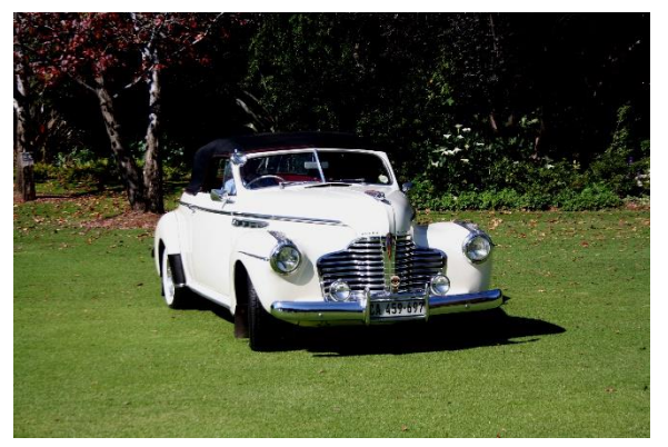
Graham Blackbeard's 1941 Buick Special model 44C Convertible