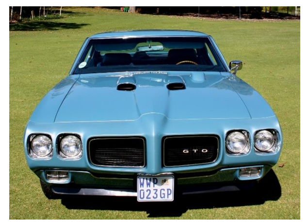
Nick Tozer's 1969 Pontiac GTO