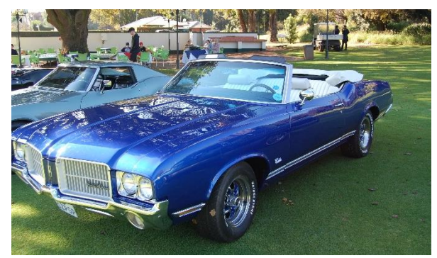
Adina Katz's 1972 Oldsmobile Cutlass Convertible