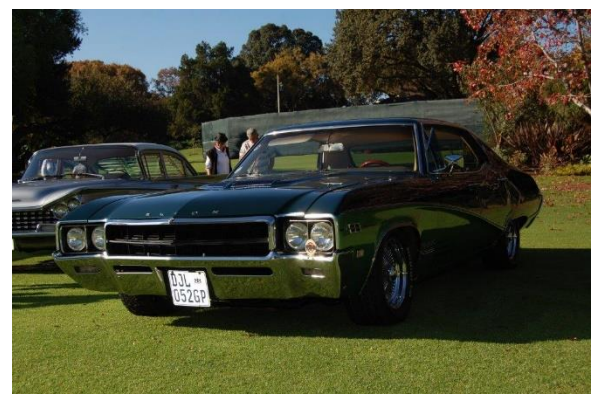
lain Pursey's 1968 Buick Skylark series 43500 4d sedan - modified