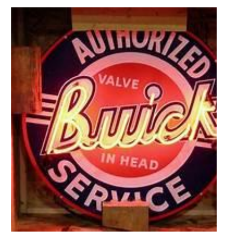
Post World War 2