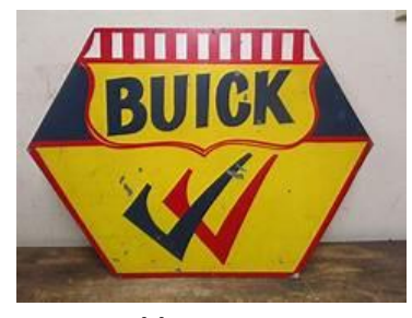
Post World War 2