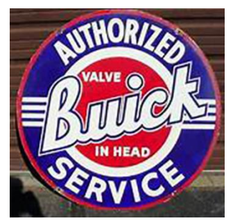
Post World War 2