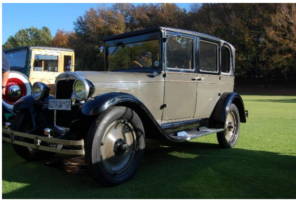
Peet & Elise Wessels' 1927 Chevrolet Sedan