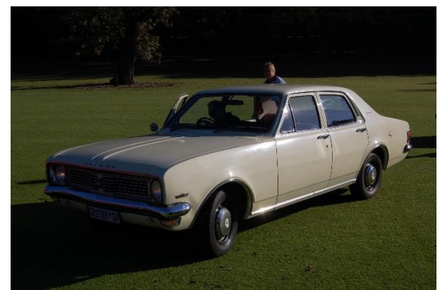
Burt Lopes' 1969 Holden Kingswood Sedan