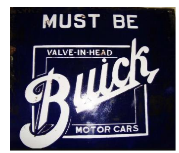
1920 – 1930