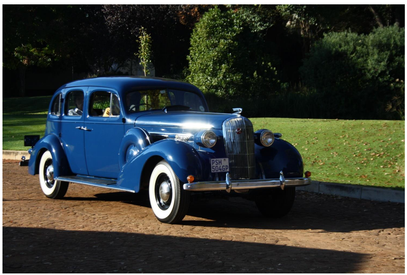
Roley Nofke's's magnificent 1936 Buick Roadmaster Sedan