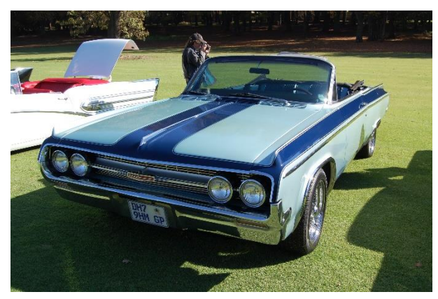
Kevin Derrick's 1964 Oldsmobile Dynamic 88 convertible