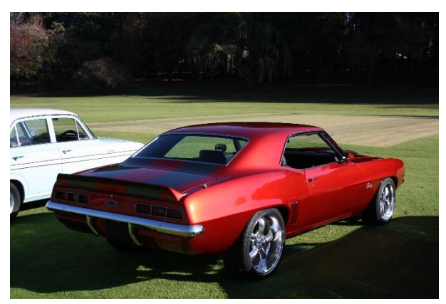
Allan Boonzaier;s 1969 Chevrolet Camaro Coupe