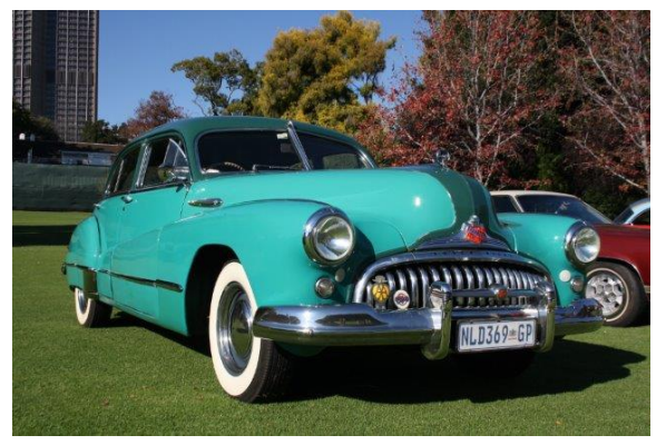
Pierre Koch's 1947 Buick Super model 51 sedan