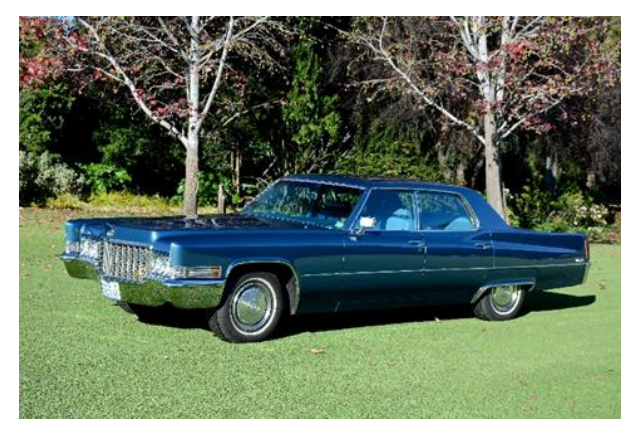
Rudolph Nicholson's 1970 Cadillac de Ville Sedan