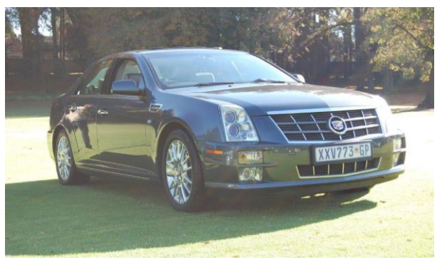
Rudolph Nicholson's 2009 Cadillac STS