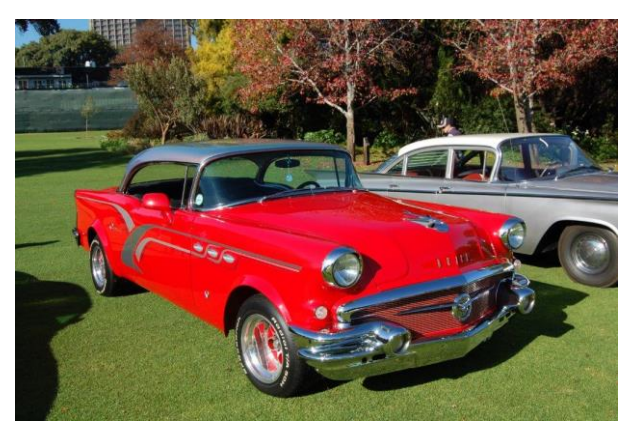
Johan & Elsa Griese's l1956 Buick Special model 46R Riviera hardtop – modified