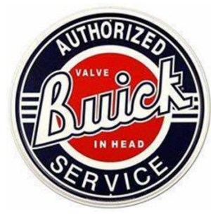
Post World War 2