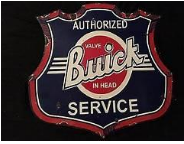
Post Word War 2