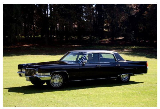
Rudolph Nicholson's 1969 Cadillac Fleetwood Sedan