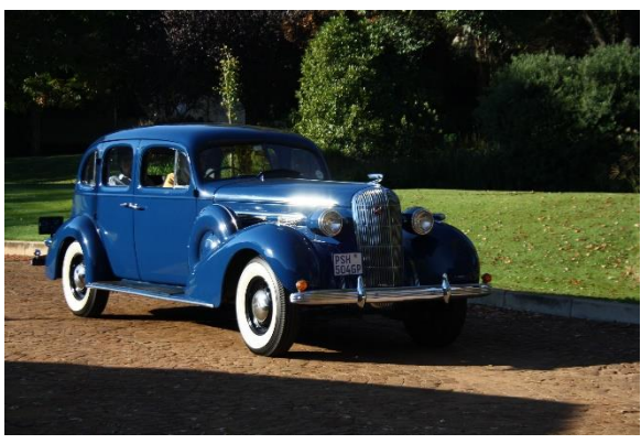
Roley Noffke's 1936 Buick Roadmaster-series 80 -81 sedan