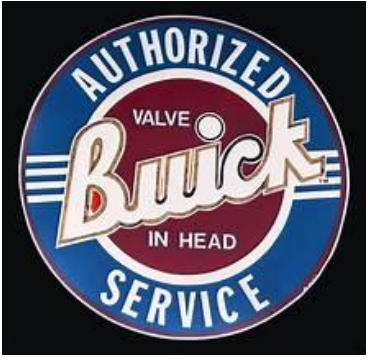
Post World War 2