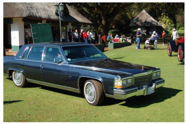
Trevor & Ellen Eilenberg's 1984 Cadillac Fleetwood Brougham de Elegance