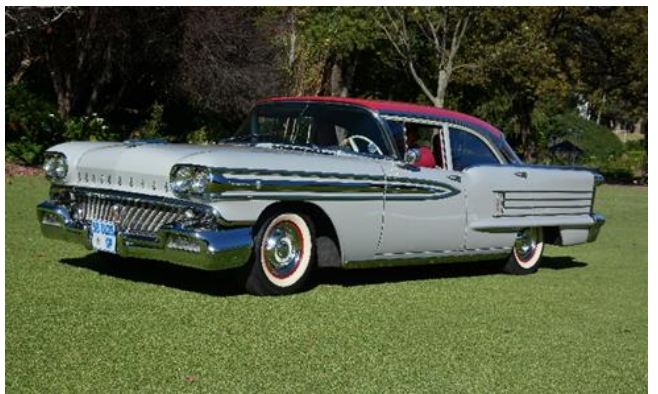
Massimo Lupini's magnificent 1958 Oldsmobile Rocket 88 sedan