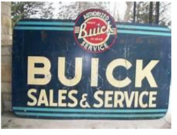
Post World War 2