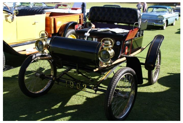
Vittorio Franscioso's 1902 Oldsmobile Curved Dash