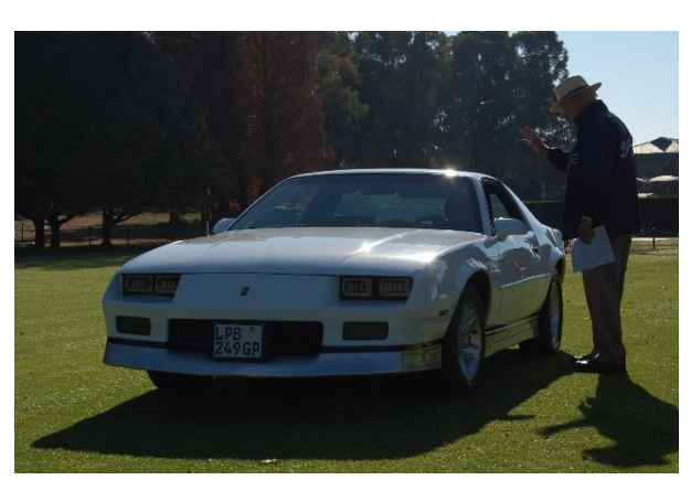
Gustav Pansegrouw's 1988 Chevrolet Camaro Coupe