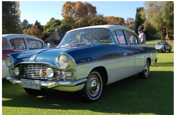
Helene de Villiers' 1961 Vauxhall Velox 2.6