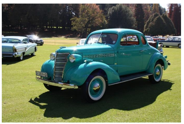
Allan Du Preez's 1938 Chevrolet Coupe