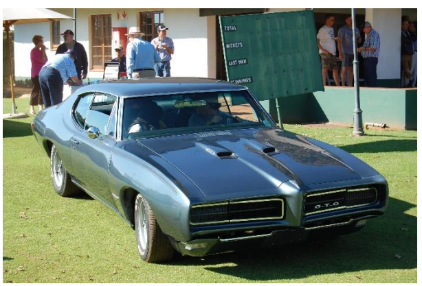
Tyrone Tozer's 1968 Pontiac GTO