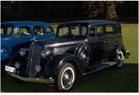
Eric McQuillian's 1935 Buick series 40 model 41 Sedan