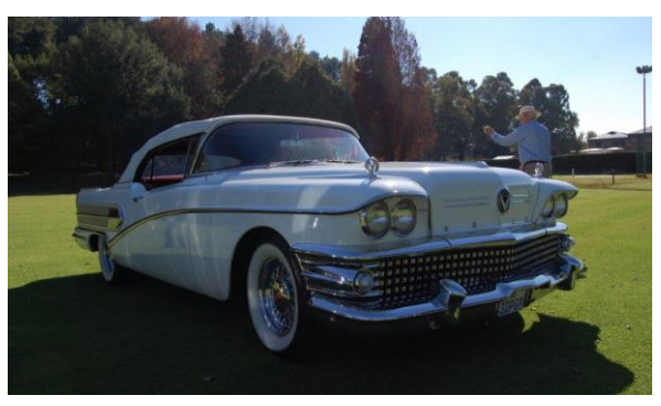
Kevin Derrick's 1958 Buick Special model 46C Convertible – modified